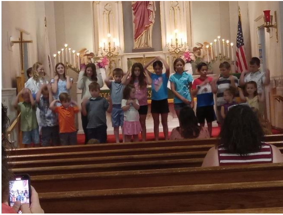
Vacation Bible School singing on Sunday, June 30